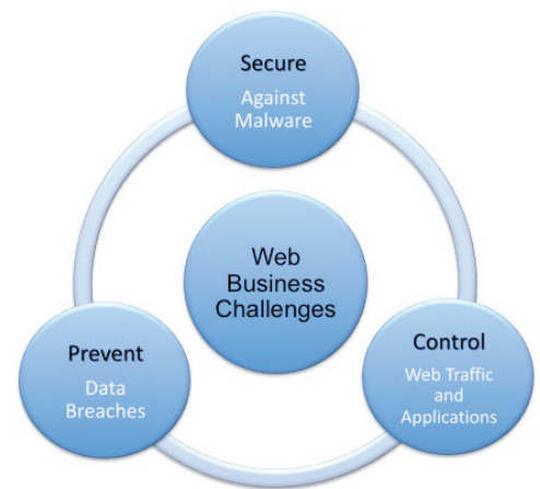
Secure Web Gateway: Secure, control, prevent. A comprehensive security solution to the business challenges of the web.

Customers enjoy low total cost of ownership (TCO), as these powerful applications are integrated and managed on a single appliance. Robust management and reporting tools deliver ease of administration, flexibility and control, as well as complete visibility into policy- and threat-related activities.